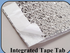
Integrated Tape Tab

To find out more about Fi-Foil's RetroShield® System Metal Building Insulation Solution