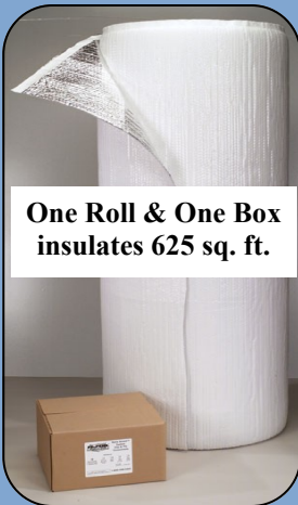
One Roll & One Box insulates 625 sq. ft.