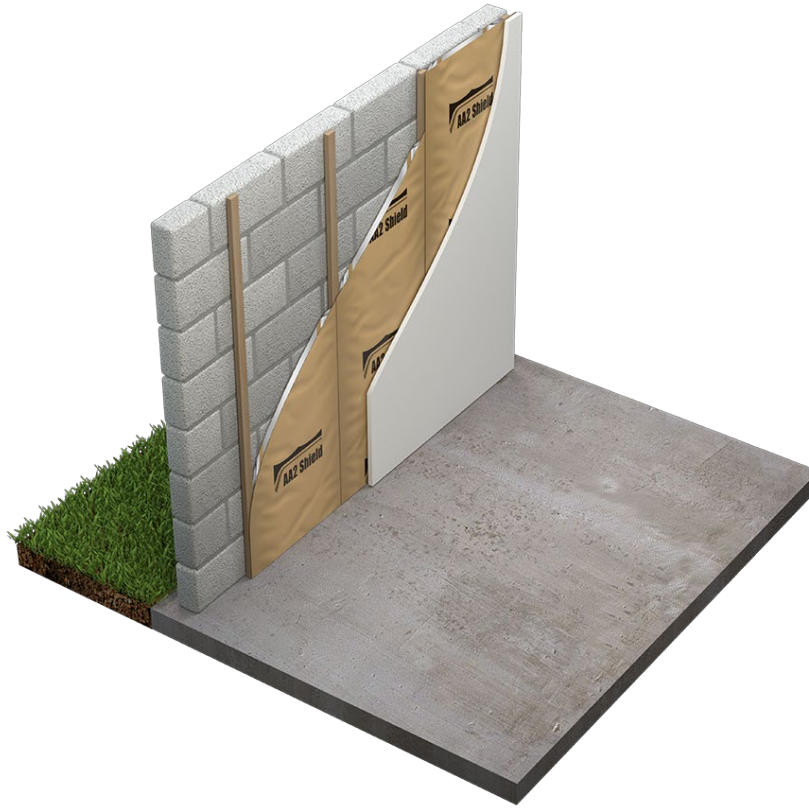
FIGURE 1 - AA-2 Vapor Shield (Perforated Version)