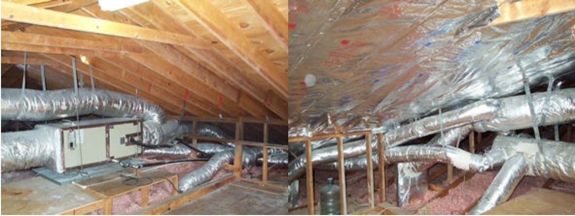
Figure E-3. Site #199 pre retrofit. Note attic air handler.