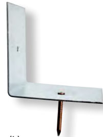
Angle Clip (L)