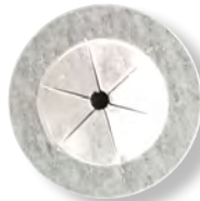
Washers – Silver