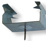
Tube Clip (U) - 2x1