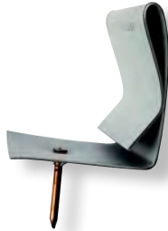
Purlin Clip (C)