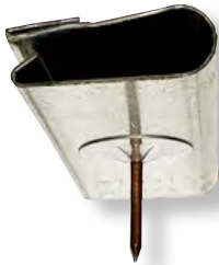
Beam or Bar Joist Clip (Z)