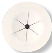
Washers – White