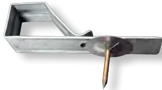
Quick Attach Clip (Q)