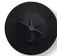
Washers – Black