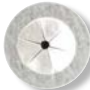
Washers - Silver