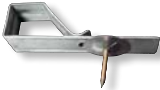
Quick Attach Clip (Q)