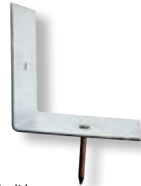
Angle Clip (L)