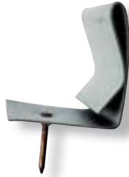
Purlin Clip (C)