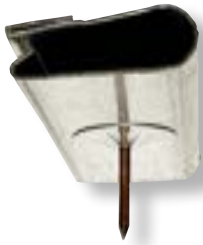
Beam or Bar Joist Clip (Z)