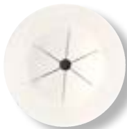
Washers - White