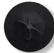
Washers - Black