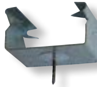
Tube Clip (U) - 2x1